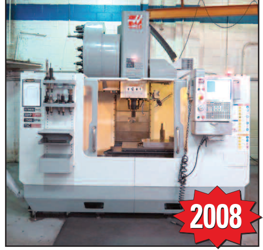
2008 HAAS VF-3YT-50 4-Axis VMC