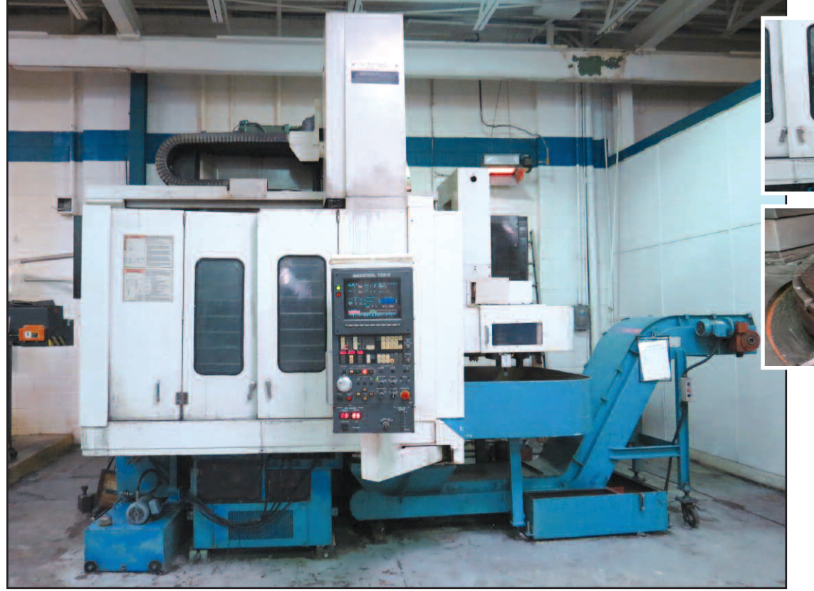
MAZAK Megaturn A-12 CNC Vertical Turning Center, Mazatrol T32-2 Control, 49.2" Chuck, 57.1" Max Swing, 48.2" Max Height Under Rail, 48" Max Cutting Height, 350 RPM, 16 ATC, Coolant Through Spindle, 30 HP, sn 90796

• 1995 TOSHIBA BTD-110R16 5-Axis CNC Table Type Horizontal Boring Mill, Tosnuc 888 Control, Travels: X-98.4", Y-71", Z-57", W-19.7", 4.33" Spindle, 55"x63" Rotary Table, Table Index 0.001", 60 ATC, Cat 50, 2,500 RPM, Rapid Traverse 394 IPM, Table Load Capacity 13,860 lbs, Coolant Through Spindle, Chip Conveyor, Vertical Head Attachment, 40 HP, sn 143590