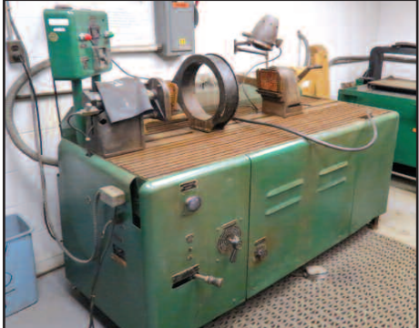
MAGNAFLUX AN 04845AO Magnetic Particle Inspection