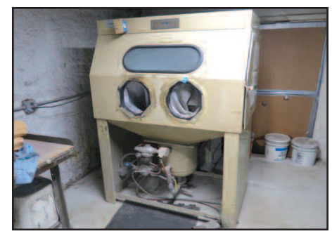
ICM Abrasive Blast Cabinet