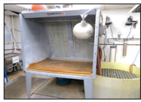
DEVILBISS Paint Booth