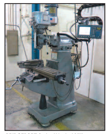
BRIDGEPORT Series I Vertical Mill