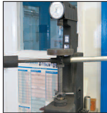
WILSON Rockwell 5TT Hardness Tester