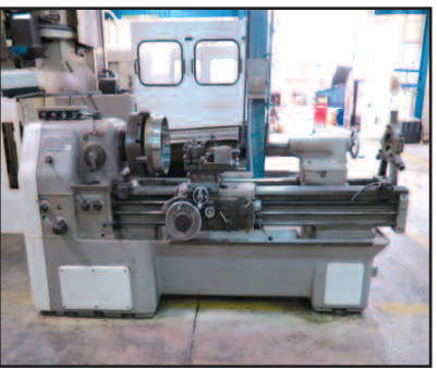
DONG YANG LS 24"x 60" Engine Lathe