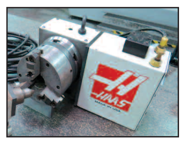
HAAS 4th Axis Rotary Table

• 2008 HAAS VF-6/50 4-Axis, Travels: X-64", Y-32", Z-30", Table Size 64"x28", 7,500 RPM, Cat 50, 30 ATC Side Mount, Spindle Nose To Table 5"-35", Table Cap. 4,000 lbs, Rapid Feed Rate 600 IPM, Max Cutting Rate 500 IPM, Coolant Through Spindle, Chip Auger, 30 HP, sn 1067789