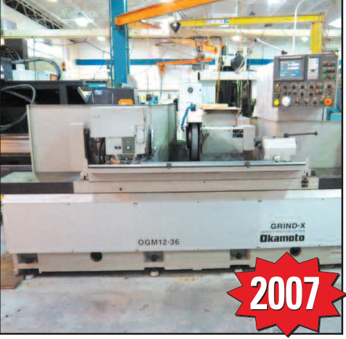
2007 Okamoto OGM-1236U Programmable Universal Cvl. Grinder