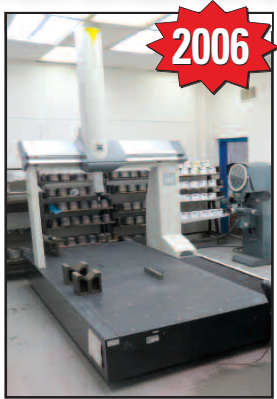
2006 BROWN & SHARPE CMM