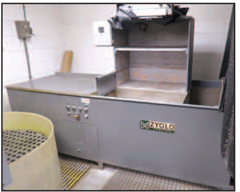
ZYGLO Penetrant Inspection Station