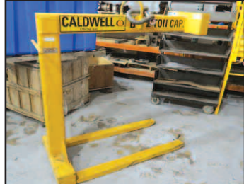
CALDWELL 4,000 lb C Frame Crane Hook