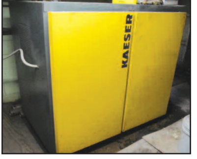
KAESER Air Compressor