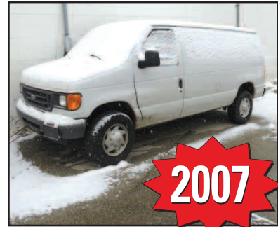
2007 FORD E250 Super Duty Van