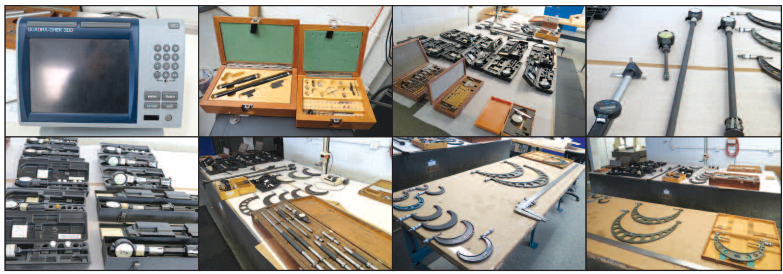
View of Testing Equipment