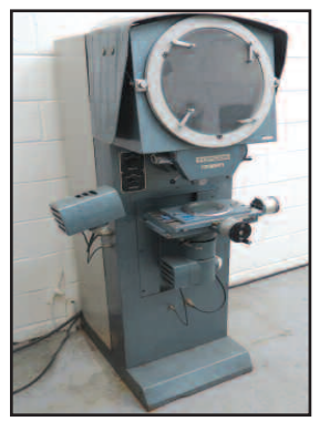
TOPCON 14" Optical Comparator