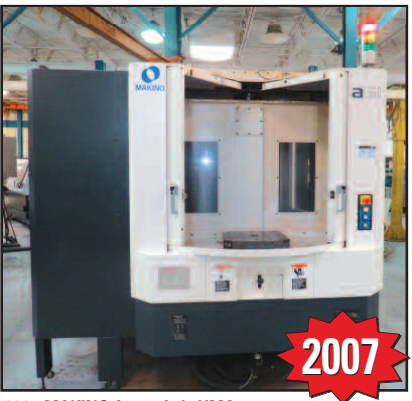
2007 MAKINO A51 4-Axis HMC