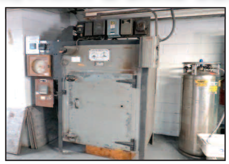
LEYDON BROS Electric Oven