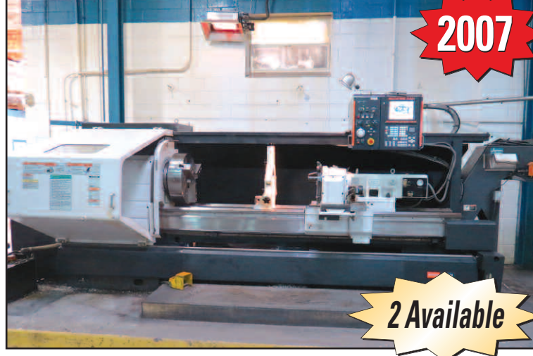
2007 MAZAK M-5N-2000 Flat Bed CNC Lathe