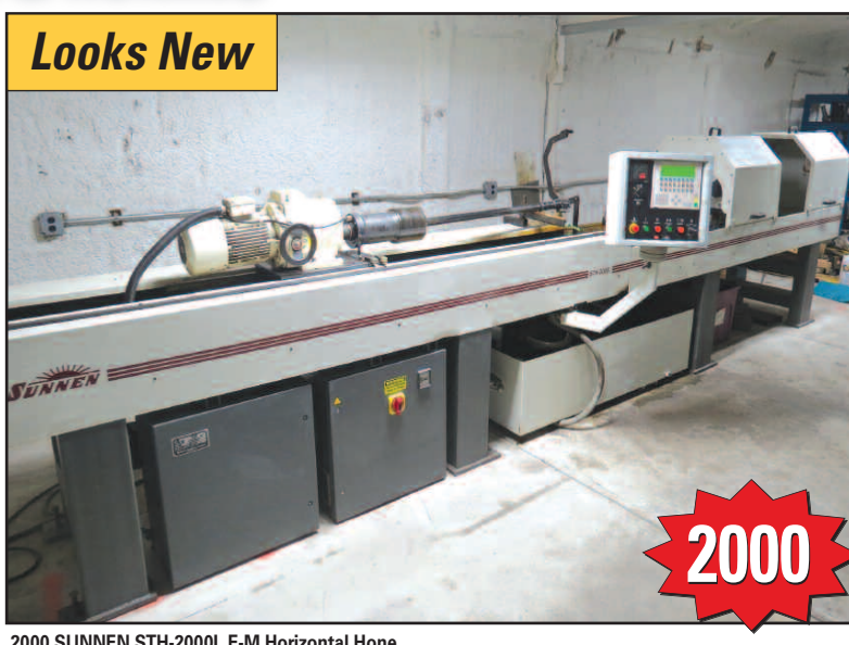
2000 SUNNEN STH-2000L E-M Horizontal Hone