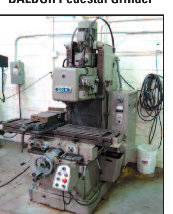
OKK MH-2V Vertical Mill