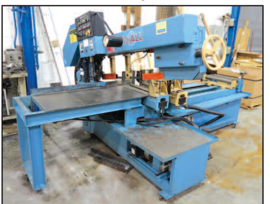
DOALL C-916SA Horiz. Band Saw