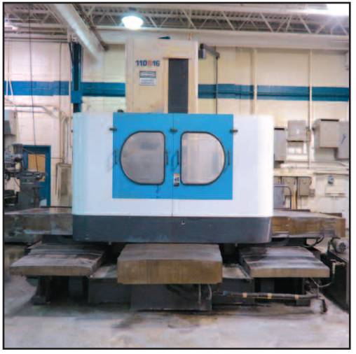
1995 TOSHIBA BTD-110R16 5-Axis CNC Table Type Horiz. Boring Mill