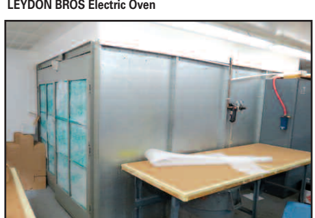
JBI Spray Booth